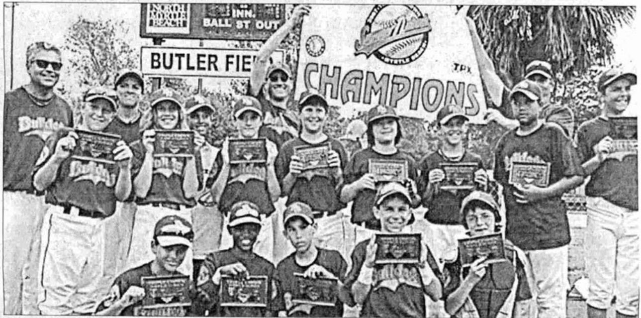
Pictured above, the victorious Brooklyn Bulldogs smile with their coaches and their championship plaques.

As a contender in the Triple Crown Sports Summer Nationals in late July, the Brooklyn Bulldogs 10 and under youth travel baseball team went to Myrtle Beach, South Carolina and returned to Brooklyn as the national champion.